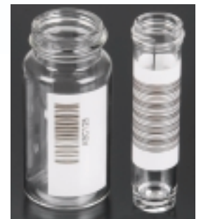
STANDARD WRAP AROUND